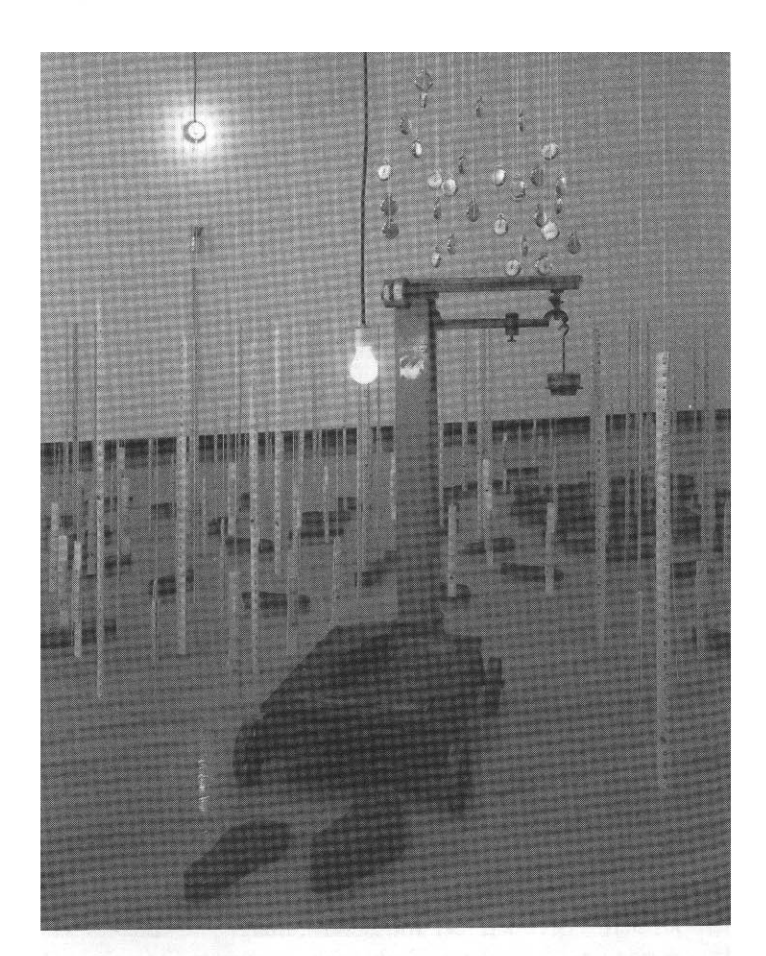
Fig. 15. Ellen Rothenberg, "Conditions for Growth," 1994. Installation detail. From The Anne Frank Project.

In her "Conditions for Growth" installation, thick steel footprints haunt a room filled with scales, pocket watches, rulers, and thermometers, evocative of both a concentration camp's sterile display of material evidence and a littered Umschlagplatz (collection point), especially a grocer's scale that balances the words "YOU" against a loaf of bread. It appears heavily based on a historical knowledge of the Nazis' bureaucratic and industrialized killing, while epitomizing Arendt's "banality of evil." Visitors are encouraged to record their height on the gallery wall, not in a doubling homage to the loving father Otto Frank, who charted his daughters' growth in the Annex, but to subject us to surveillance while revealing our